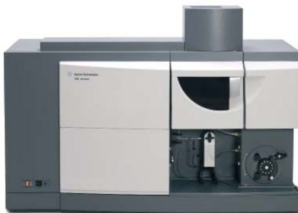
Figure 1. The Agilent axially-viewed 730 ICP-OES, shown with the optional SVS1 Switching Valve System.

Use of the Sheath Gas Torch on an axially-viewed ICP provides prolonged instrument stability and lower detection limits when analyzing samples of (very) high total dissolved solids (TDS) content. Moreover, as periodic recalibration and sample dilution are no longer necessary, productivity is increased.