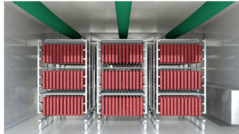
Fig.1 Air distribution with hose system