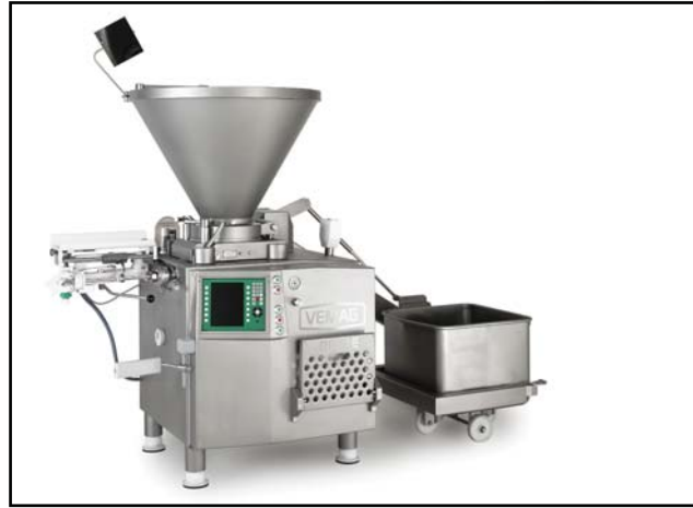
DP10E with DHV841

Filling speeds of up to 6 (DP10E) or 7 (DP12E) tonnes an hour – adequate reserves for every requirement of the large-scale plant.