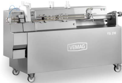
Flexible Sausage Line FSL210

FSL210 – Program name: Flexible Sausage Line. A machine that can be universally used in sausage production – flexibly adapting to almost every application. Flexibility is by far the word that best describes the FSL210. It is used in your production, where a wide variety of different products are produced – precisely where a machine is flexibly adapted to the product and not the other way round. The FSL210 implements product ideas.