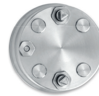
Fast clamping nut for knives (optional)