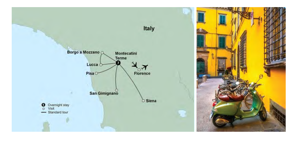
9 Days ● 10 Meals : 7 Breakfasts, 3 Dinners