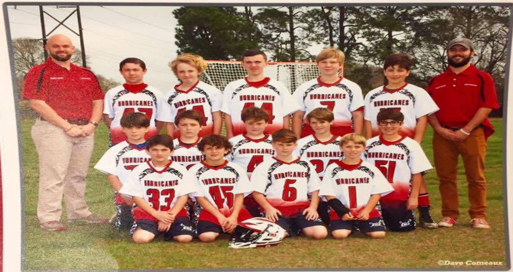
Lafayette Hurricanes Lacrosse U-12 Team (2017)