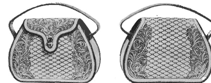
For complete patterns of this bag and four other bags order "Modern Trend" from your Craft Dealer. Price $1.25

Cuts, scratches and blemishes, such as tick marks and neck wrinkles, in the leather are completely covered by the set stamp design. This is important for it allows the use of leather that would otherwise be scrapped. Such was the case with the bag pictured below but by using Craftool No. 514 the barbwire scratches were completely covered with the very pleasing results shown.