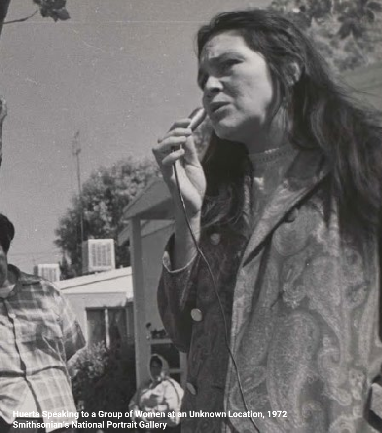
Huerta Speaking to a Group of Women at an Unknown Location, 1972