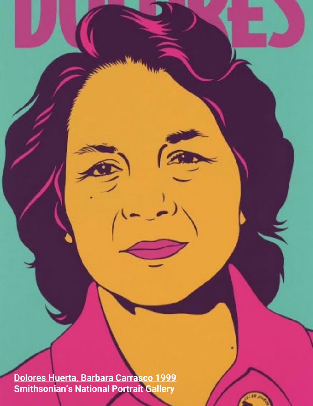
Dolores Huerta, Barbara Carrasco 1999 Smithsonian's National Portrait Gallery