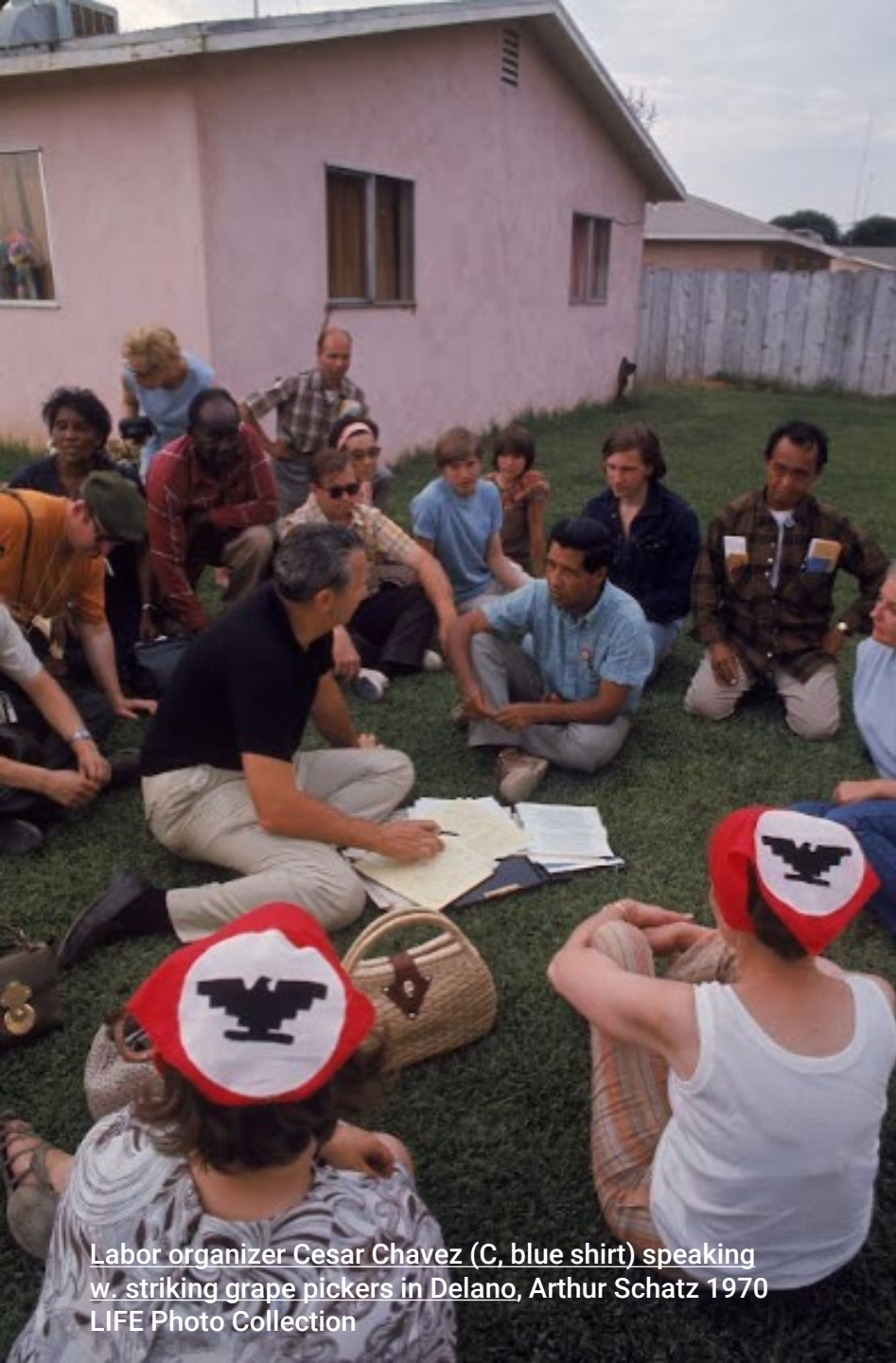
Labor organizer Cesar Chavez (C, blue shirt) speaking w. striking grape pickers in Delano, Arthur Schatz 1970 LIFE Photo Collection