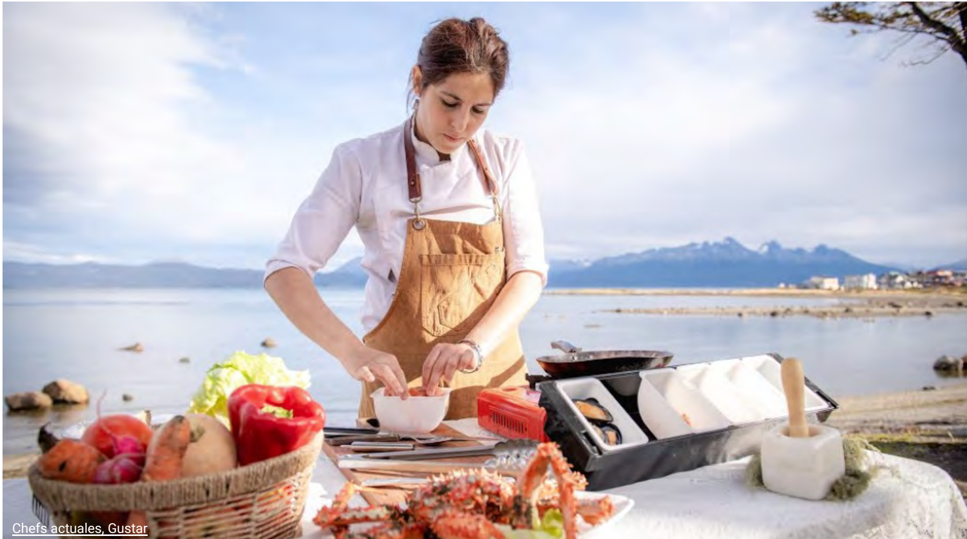
Chefs actuales, Gustar

In many parts of Argentina, women are leading the way in groundbreaking gourmet cooking. Some are chefs at restaurants or work on TV. Others grow their own food. They are all revolutionizing traditional foodways while also focusing on regional products.