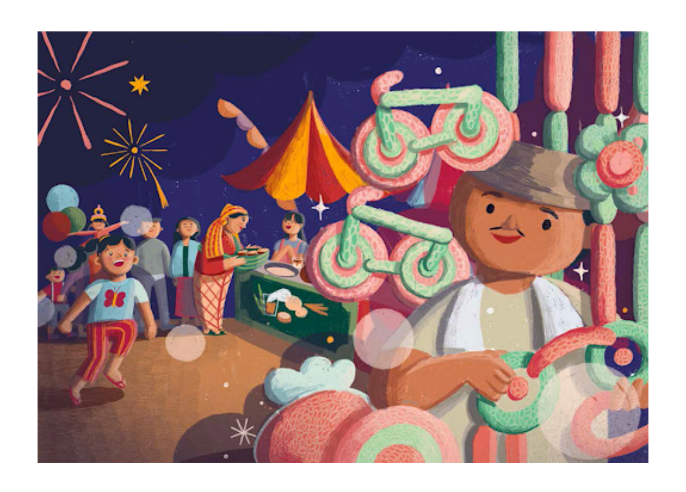
Suddenly Euis froze, spotting something. That's...that's...the jipang bike!