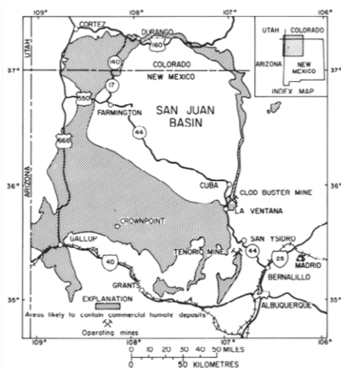
Figure 1. Locations of humate mines and areas likely to contain commercial humate deposits, northwestern New Mexico and southwestern Colorado.

GTX Organics is a specialty manufacturer that develops and supplies natural ingredients that are organically registered with Washington State Department of Agriculture (WSDA) for organic food production, providing for a variety of customer requirements worldwide. Our proprietary organic extraction (brewing) and pre-concentration process produces fulvic acid in liquid and nearly pure powder forms. Our brand of fulvic and humic acids include GTX Gold-L, Alkaline Gold and Black Fulvic Acid equivalent dry powders have been evaluated according to the USDA National Organic Program standards by WSDA. The organic fulvic acid or may be further formulated into specialty natural base products for our customers on a confidential basis. GTX's raw natural ingredients are obtained from known high quality sources with the highest control standards to ensure manufactured products are of the highest purity.