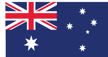
Flag of Australia