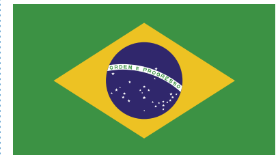
Flag of Brazil