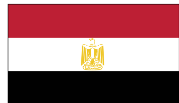
Flag of Egypt