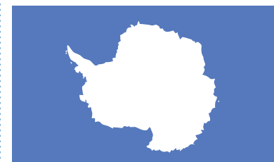
Flag of Antarctica