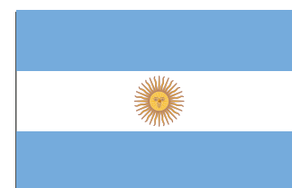
Flag of Argentina