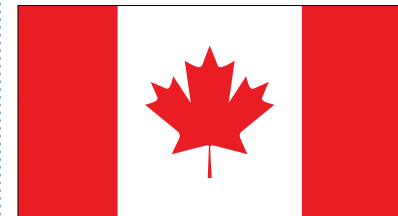
Flag of Canada