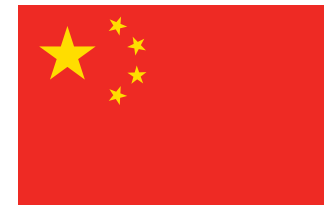
Flag of China