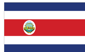
Flag of Costa Rica