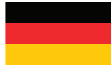
Flag of Germany