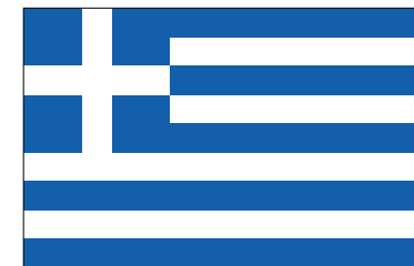
Flag of Greece