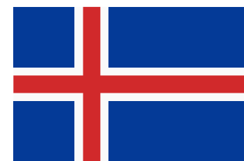
Flag of Iceland