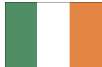
Flag of Ireland