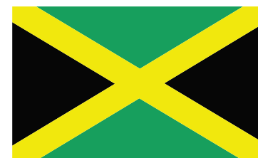
Flag of Jamaica