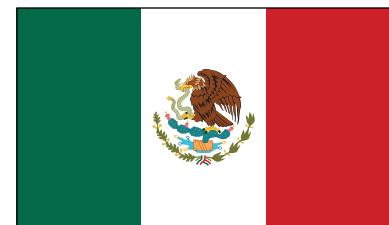
Flag of Mexico