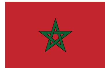
Flag of Morocco