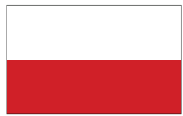
Flag of Poland