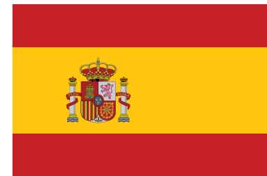
Flag of Spain