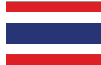
Flag of Thailand