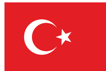
Flag of Turkey