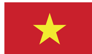
Flag of Vietnam