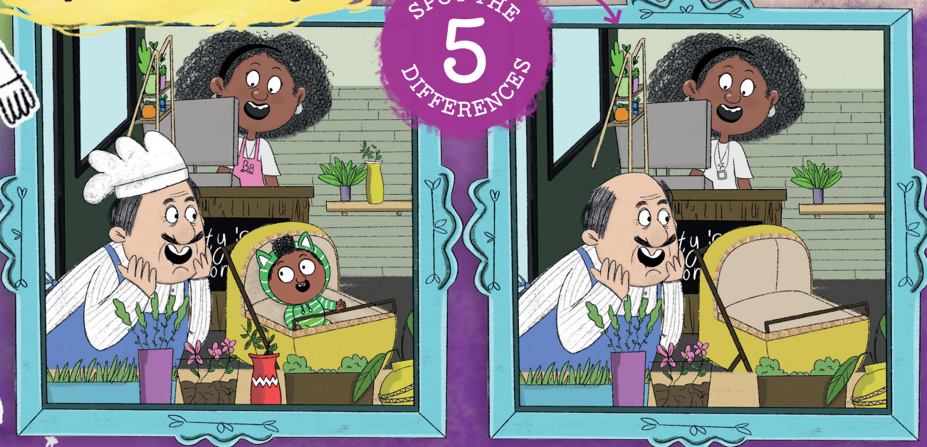
Worried and angry at the same time!