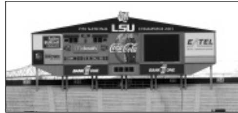
Scoreboard in Tiger Stadium

The TAF provided LSU with unquestionably the most advanced academic facility in America for its student-athletes. By renovating LSU's old Gym Armory, the TAF allowed LSU to make the emphatic statement that the academic welfare of its student-athletes is its foremost priority. Opened in 2002.