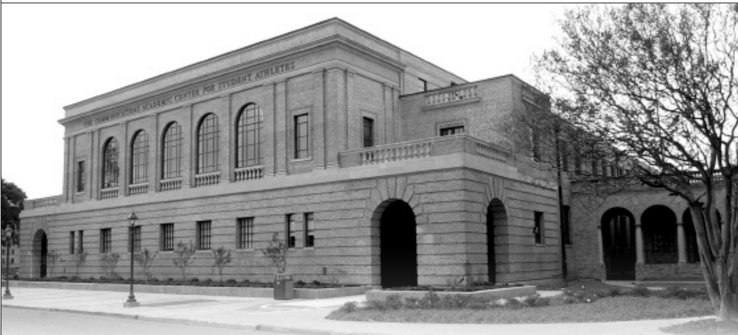
The Cox Communications Academic Center for Student-Athletes is perhaps TAF's most significant contribution to the University to date. The center benefits not only LSU's athletics program, it also provides a 1,000-seat classroom for use by the entire University population.

Unrestricted contributions to the Tiger Athletic Foundation benefit every athlete and team at LSU through scholarship and academic awards, as well as through the construction and maintenance of athletic facilities. These projects, large and small, chart the unmistakable course to excellence. And it is the shared vision of alumni and friends of LSU that are making them a reality.