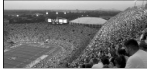
Eastside Expansion of Tiger Stadium

The TAF financed an eastside expansion that added over 11,000 seats to Tiger Stadium and moved it up among the five largest on-campus stadiums in America. The eastside expansion not only created 70 Tiger Den suites to the stadium, it has provided over 300,000 more fans the opportunity to see LSU football since the expansion was opened in 2000.