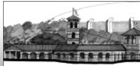
Mike the Tiger's Habitat

LSU's legendary live mascot is getting a new home, thanks to the TAF. This new habitat will provide Mike with a new 15,000-square foot environment with lush planting, a landmark size Live Oak tree, a beautiful waterfall and a stream evolving from a rocky backdrop overflowing with plants and trees. It will be one of the finest live tiger habitats in America. Scheduled to open in the fall of 2005.