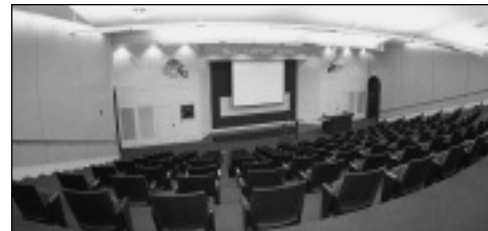
Lawton Squad Room

The TAF added to fan enjoyment in LSU's major athletics facilities by purchasing state-of-the-art video scoreboards in 1998.