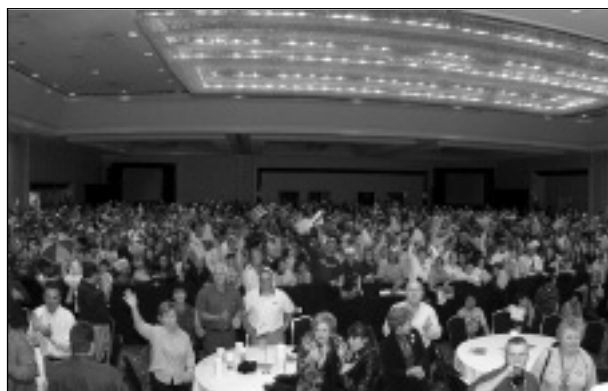
Inside LSU Football with head coach Nick Saban hit the road again in 2003 for the National Championship Edition of Inside LSU Football at the Sugar Bowl with a live telecast from downtown New Orleans.

Check local listings for air times as well as the affiliate that Inside LSU Football with Nick Saban can be viewed.