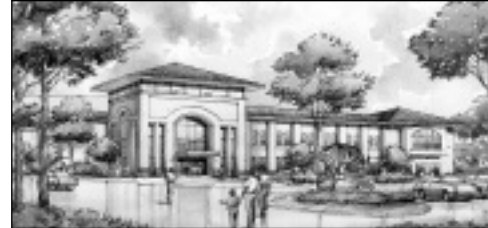
Football Operations Center

The TAF is building a stand-alone Football Operations Center in which all facets of the national champion Tiger football program will be under one roof. The building will include locker rooms, meeting rooms, coaches offices, video operations, a training room and strength facility. Scheduled to open in the fall of 2005.