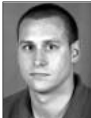
Adam Gase Graduate Assistant