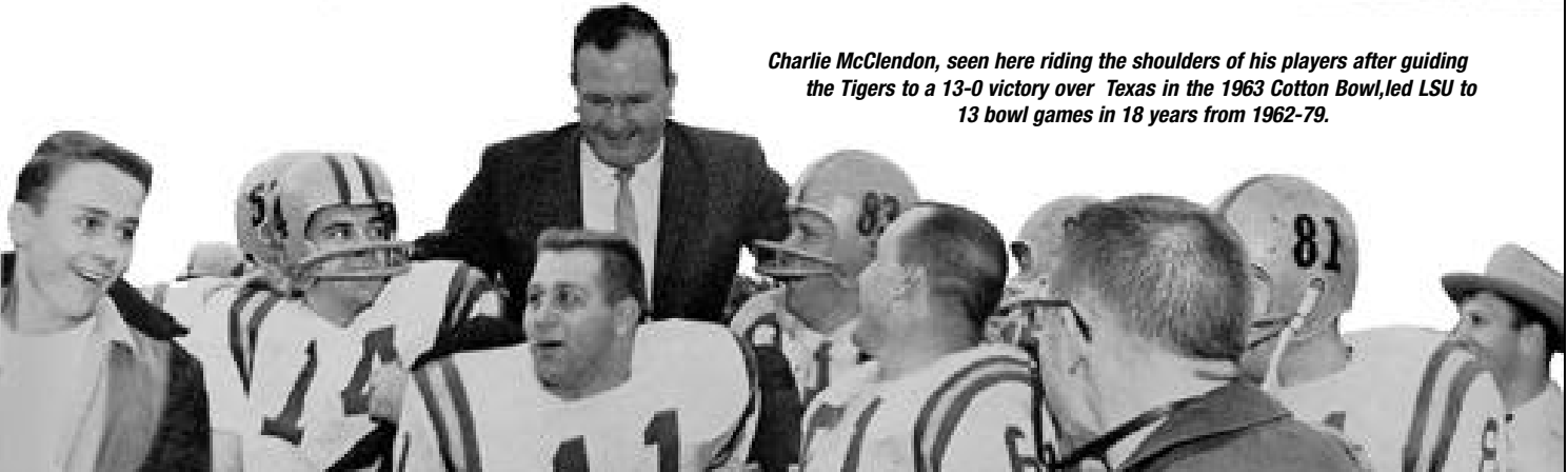
Charlie McClendon, seen here riding the shoulders of his players after guiding the Tigers to a 13-0 victory over Texas in the 1963 Cotton Bowl, led LSU to 13 bowl games in 18 years from 1962-79.