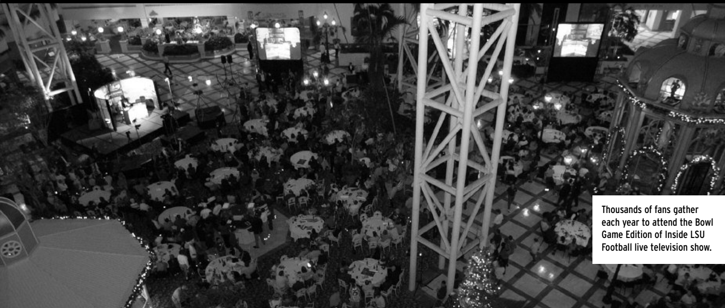
Thousands of fans gather each year to attend the Bowl Game Edition of Inside LSU Football live television show.