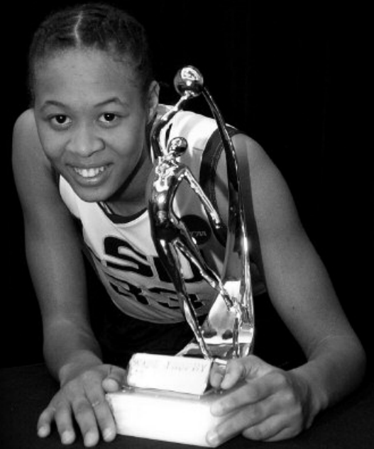
WADE, NAISMITH, AND WOODEN TROPHY WINNER FOR NATIONAL PLAYER OF THE YEAR - SEIMONE AUGUSTUS