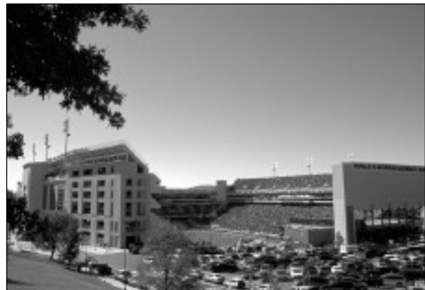
Donald W. Reynolds Razorback