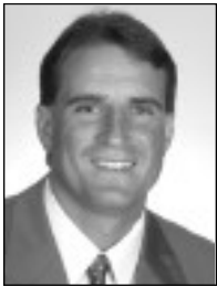
Mike Shula Head Coach

ALMA MATER: Alabama, 1987 RECORD AT SCHOOL: First year CAREER RECORD: First year FOOTBALL PHONE: 205-348-3600 WEEKLY PRESS CONFERENCE: TBD