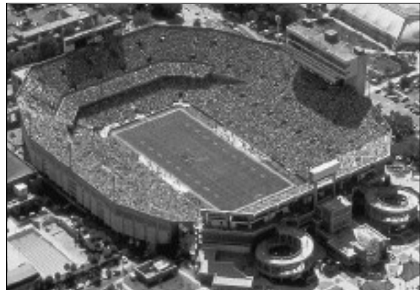
Ben Hill Griffin Stadium at Florida Field