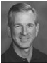
Tommy Tuberville Head Coach

ALMA MATER: Southern Arkansas, 1976 RECORD AT SCHOOL: 30-19 (4 years) CAREER RECORD: 55-39 (8 years) FOOTBALL PHONE: 334-844-9866 WEEKLY PRESS CONFERENCE: Tuesday, Noon