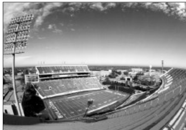
Davis Wade Stadium at Scott Field