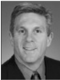
Ron Zook HEAD COACH

ALMA MATER: Miami (Ohio), 1976 RECORD AT UF: 8-5 (1 year) CAREER RECORD: 8-5 (1 year) FOOTBALL PHONE: 352-375-4683 (x.4100) WEEKLY PRESS CONFERENCE: Tuesday, 11:30 a.m.