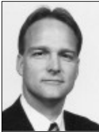
Mark Richt Head Coach

ALMA MATER: Miami, 1982 RECORD AT UGA: 21-5 (2 years) CAREER RECORD: 21-5 (2 years) FOOTBALL PHONE: 706-542-1515 WEEKLY PRESS CONFERENCE: Tuesday, 11:30 a.m.