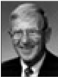
Lou Holtz Head Coach

ALMA MATER: Kent State, 1959 RECORD AT SOUTH CAROLINA: 22-25 (4 years) CAREER RECORD: 238-120-7 (31 years) FOOTBALL PHONE: 803-777-4271 WEEKLY PRESS CONFERENCE: Monday, Noon