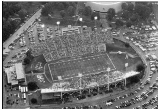
Joe Aillet Stadium