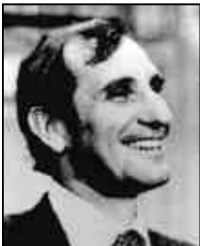
Bo Rein 1980 Record: 0-0-0