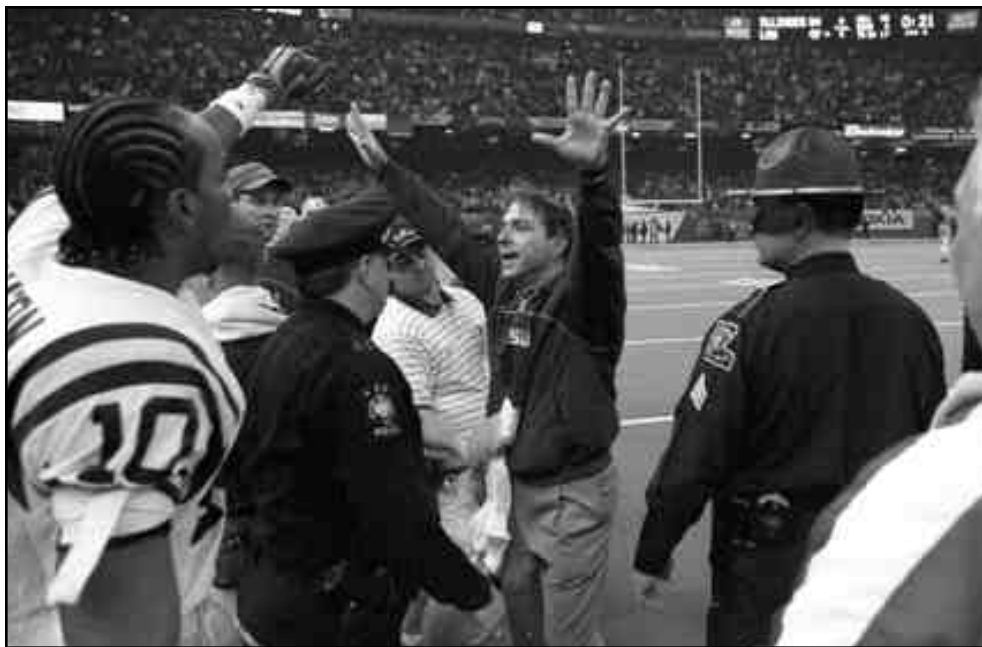
Saban received the traditional bucket shower after the Sugar Bowl win.

points surrendered in NFL history at the time.