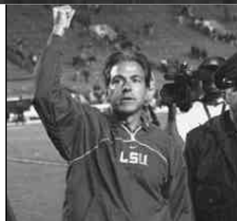
SABAN vs. ALL OPPONENTS