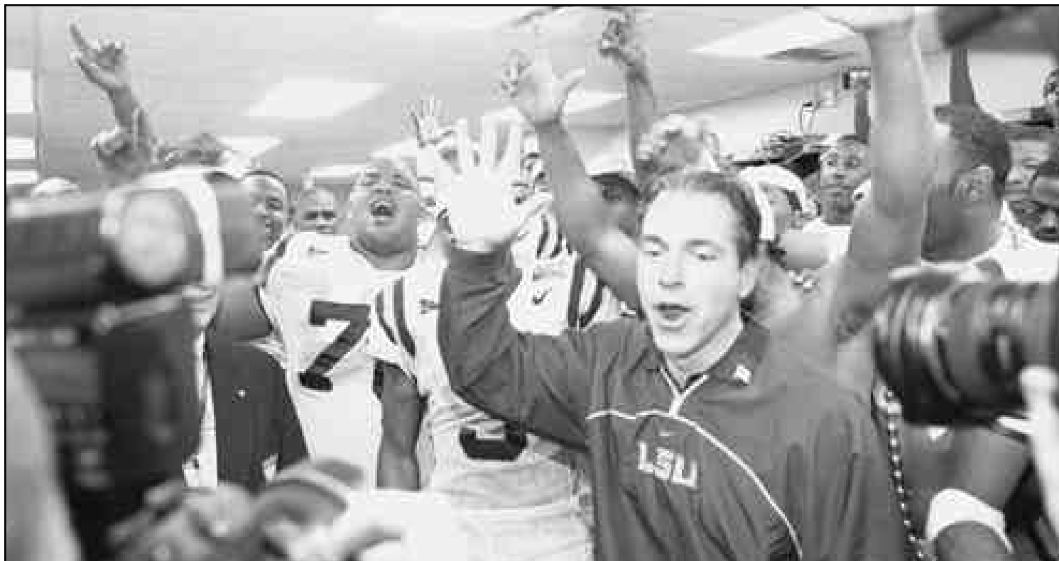
Coach Saban and the Tigers celebrate after receiving the 2002 Sugar Bowl Trophy.

nent. It worked as the Tigers began to peak during their November run, a stretch that saw LSU win at Alabama, then beat nationally-ranked foes Arkansas and Auburn at home to advance to the SEC title game.