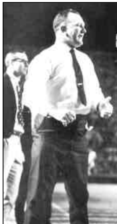
Charles McClendon led LSU to 13 bowl games in 18 seasons.