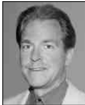
Nick Saban 2000- Two seasons Record: 18-7