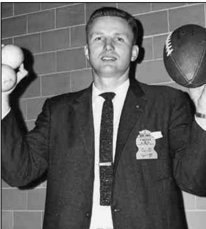
Paul Dietzel led the Tigers to the 1958 National Championship and the 1961 SEC Championship.

*** — died in plane crash on Jan.10,1980 (appointed head coach Nov. 30,1979)