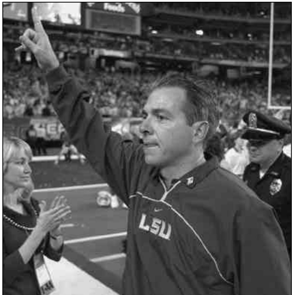
In 2001, LSU won its first outright SEC Championship since 1986.

"Instead of looking at the overall picture, he gives his players something they can really lash their teeth into, which