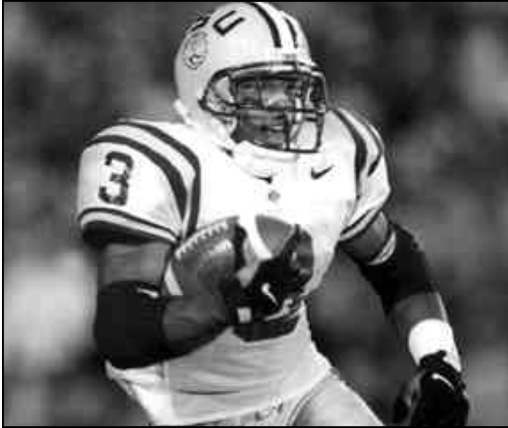
Kevin Faulk owns three of the top 10 rushing games and seasons in LSU history. He also is the SEC record holder for all-purpose yards.