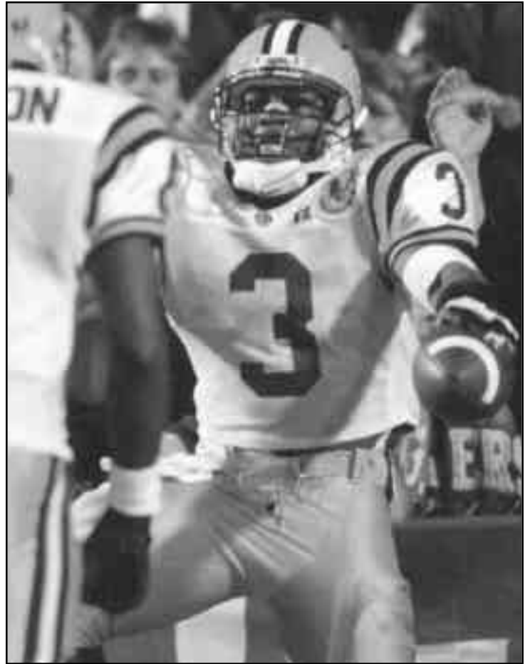
Kevin Faulk had four 200-yard rushing performances and 17 100-yard games on way to becoming the all-time leading rusher in LSU History.