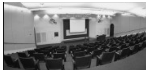
Lawton Squad Room