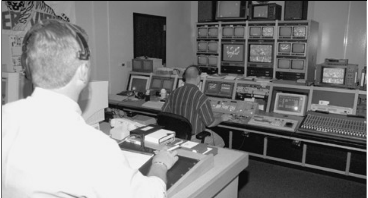
The Athletics Administration building houses a television control room that is used for video scoreboard broadcasts for football, basketball and gymnastics in Tiger Stadium and the Pete Maravich Assembly Center.