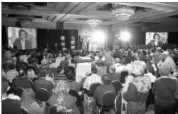
Inside LSU Football with head coach Nick Saban hit the road again in 2002 for the Cotton Bowl with a live telecast from Dallas.

Check local listings for air times as well as the affiliate that Inside LSU Football with Nick Saban can be viewed.