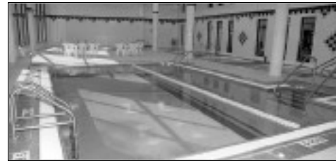
Athletic Training Center