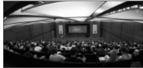
Academic Center for Student-Athletes