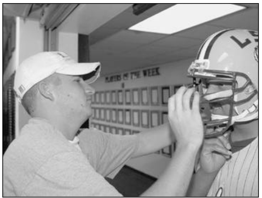
One of LSU twelve student managers sizes a player for his helmet.