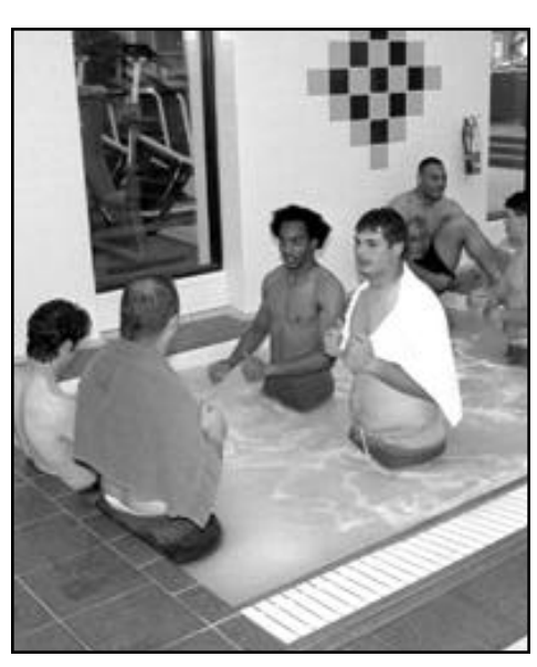
Some of the features of the 23,000-square foot facility include an on-site x-ray room, an in-house pharmacy, as well as state of the art hydrotherapy pools.