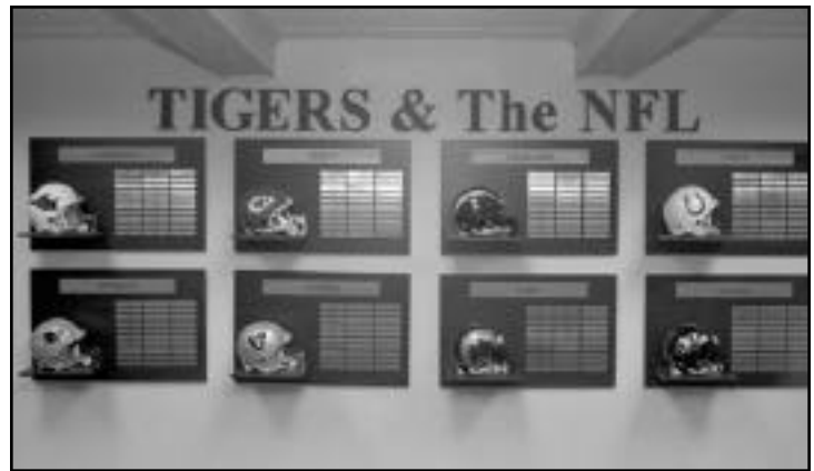
All former and current NFL players are honored in the Players Lounge.