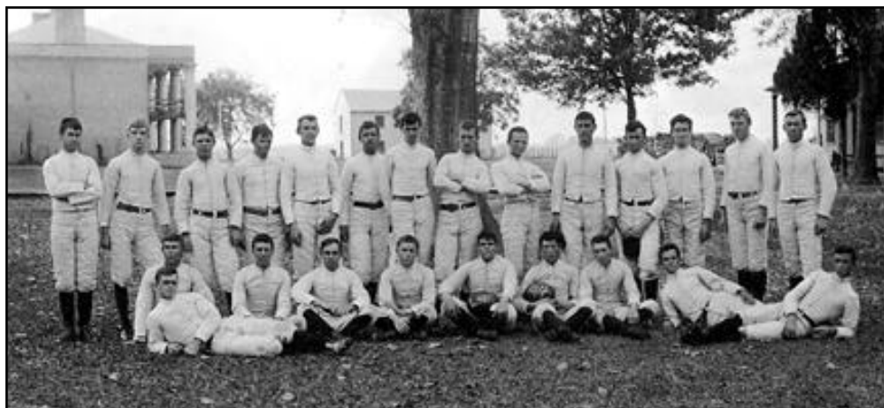
LSU cadets at football practice in the fall of 1894.

As part of the commemoration of the first 100 years of LSU football in 1993, two teams were selected to represent the greatest players in the history of the Tiger gridiron.