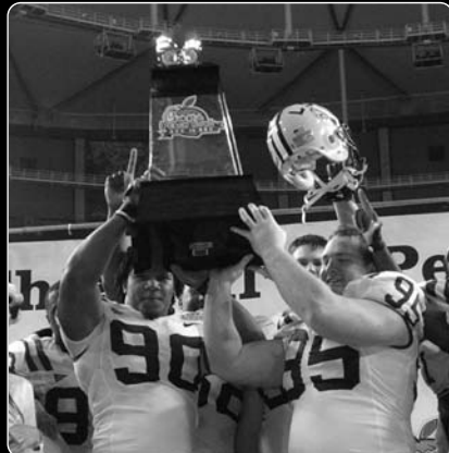
2005 PEACH BOWL CHAMPIONS, LSU FOOTBALL