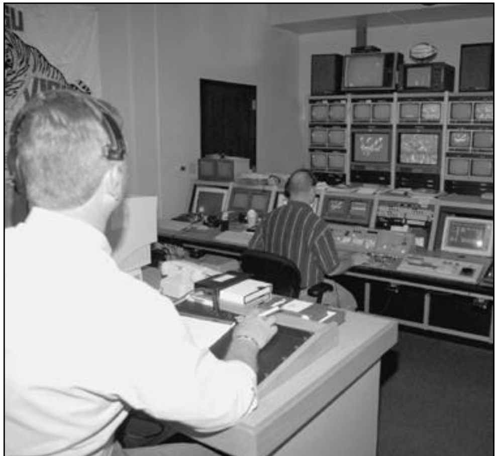
The Athletic Administration building houses a television control room that is used for video scoreboard broadcasts for football, basketball and gymnastics in Tiger Stadium and the Pete Maravich Assembly Center.