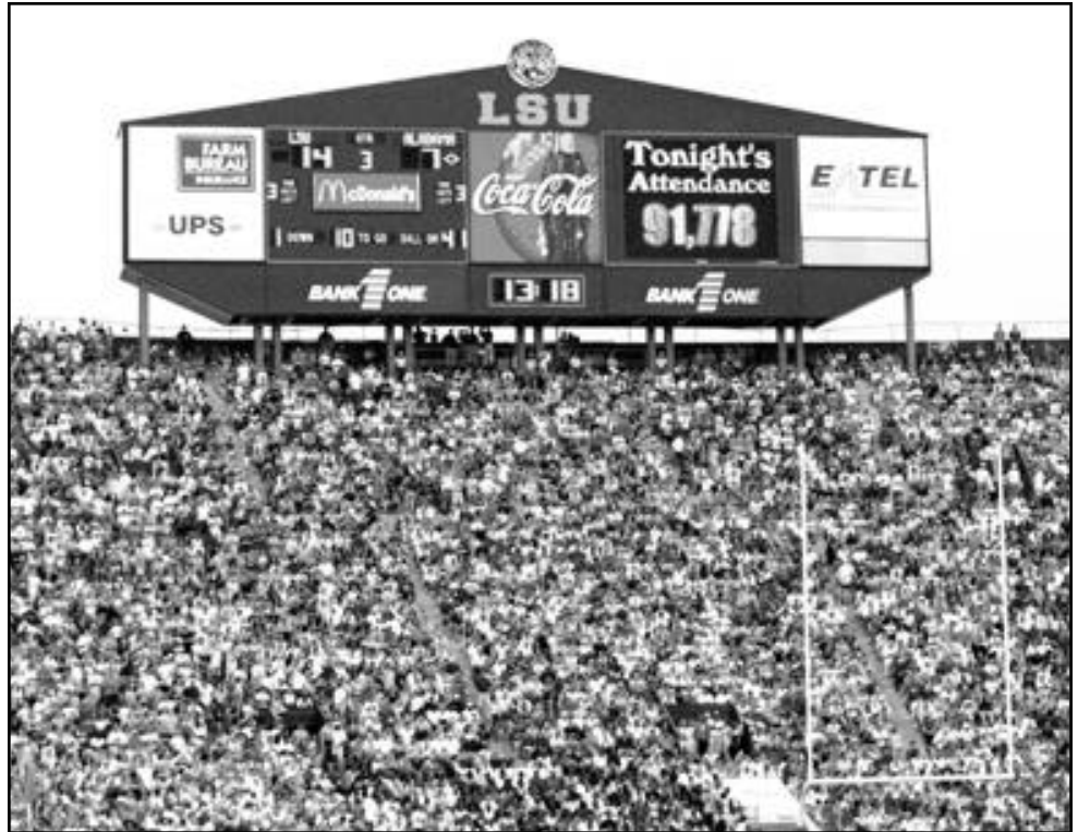
Tiger Stadium features two state-of-the-art multi-million dollar scoreboards that are equipped to show game action as well as instant replays.