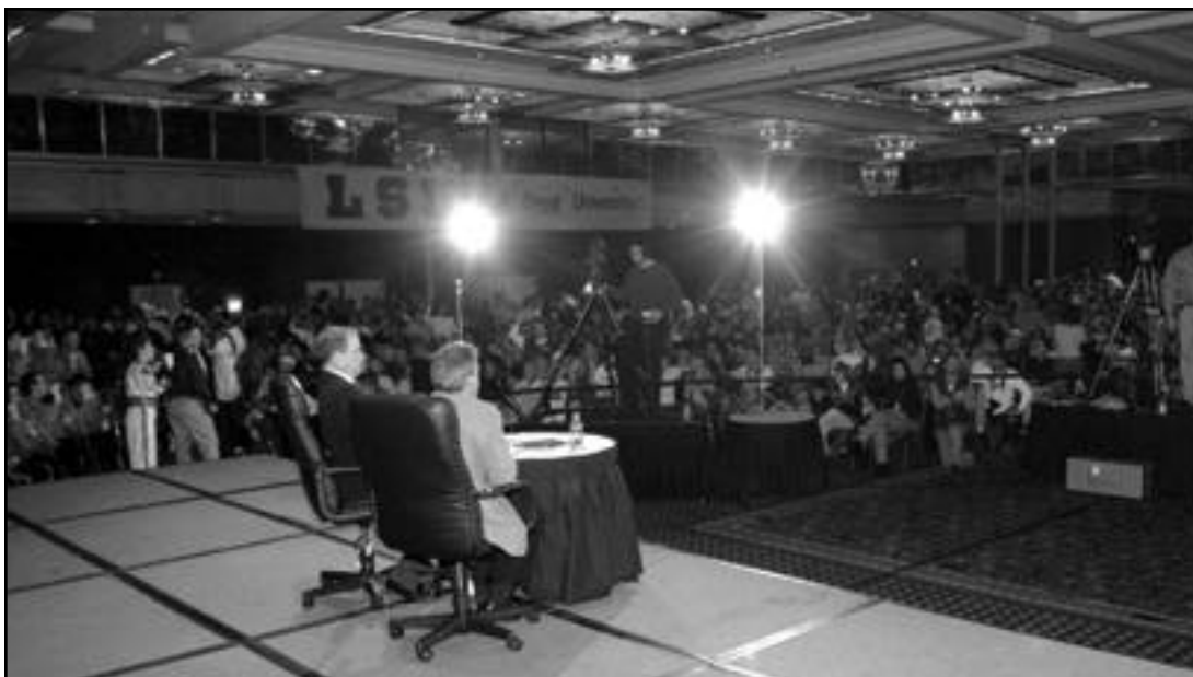
Inside LSU Football with head coach Nick Saban hit the road for the 2000 Peach Bowl with a live telecast from the Hyatt Regency in downtown Atlanta.

Times for CSSE and Fox Sports Net are TBA