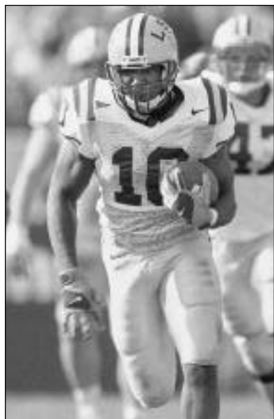
Running Back Joseph Addai