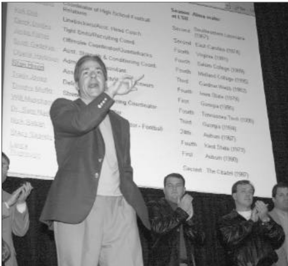
Head Coach Nick Saban addresses LSU fans at the 2003 Football Recruiting Bash at the Baton Rouge Atrium.