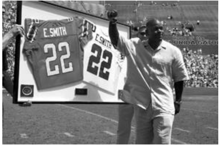
On April 12, 2003 Florida fans got the opportunity to recognize one of their own as Emmitt Smith was honored at halftime of the 2003 Orange and Blue Spring game.

Former Gator Emmitt Smith became the NFL's all-time leading rusher on Sunday, Oct. 27, 2002 with an 11-yard run against the Seattle Seahawks in Dallas. Smith surpassed the long-time record held by Walter Payton, who rushed for 16,726 yards in his 13-year.