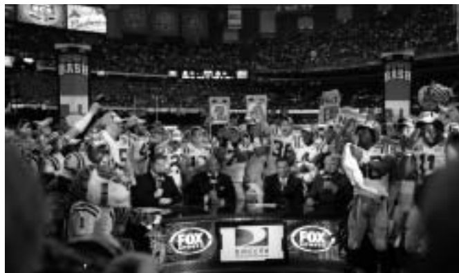
LSU celebrates the 2007 national title on the FOX Sports set after the game.

LSU football and nationally televised games have become synonymous. Last season, 12 of LSU's 14 games were broadcast to a national audience, including the first CBS primetime contest in Tiger Stadium since 1981 when the Tigers took on Florida. A school-record seven LSU games were broadcasted on CBS a year ago.