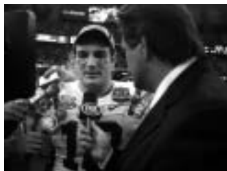
Coach Les Miles and All-American Glenn Dorsey were live on ESPN's SportsCenter from the LSU Parade Grounds following the Florida game. ESPN and ABC's Kirk Herbstreit and Brent Musburger called the Virginia Tech game in September. The CBS Early Show broadcasted nationally from Tiger Stadium the Friday morning prior to the Florida game. Jacob Hester spoke to FOX's Chris Myers on the field following the 2008 BCS National Championship Game.