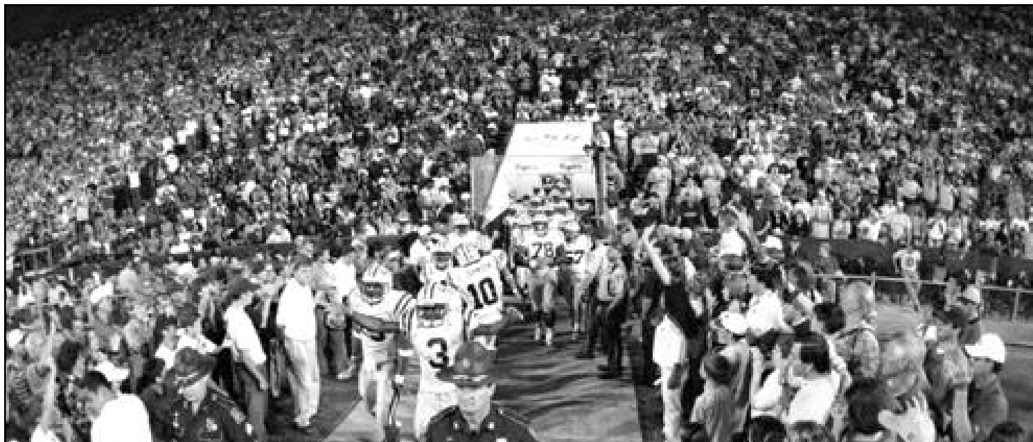
The Tigers touch the crossbar one final time for luck, then charge the field with the unbridled passion of a Tiger Stadium crowd behind them.

Above: As the sun prepares to set on Tiger Stadium on a Saturday evening during the fall, the possibility always exists that more than 91,000 crazed LSU fans will be witness to another brilliant chapter in the stadium's illustrious history.