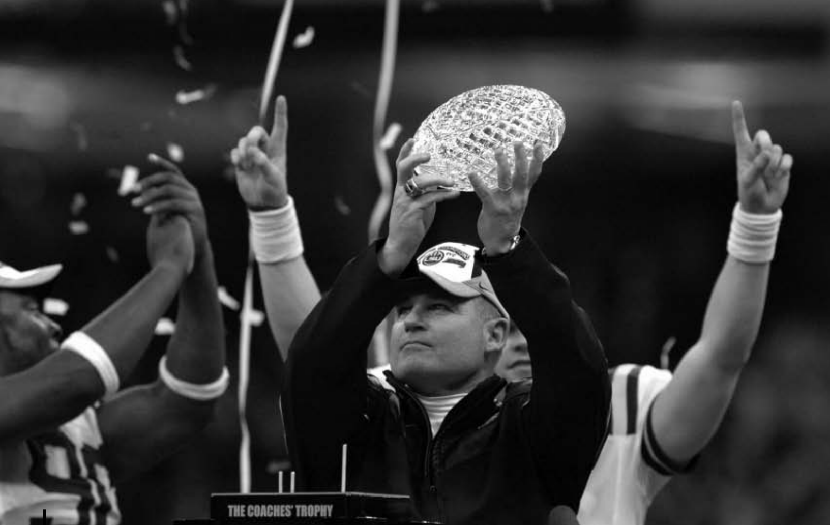
THE COACHES' TROPHY