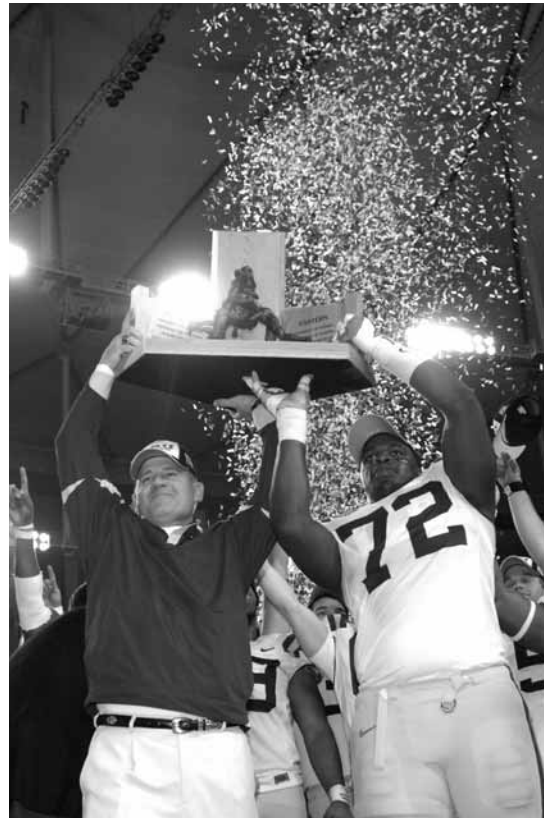
Head Coach Les Miles and Glenn Dorsey lift the 2007 SEC Trophy.

Matt Flynn's potential game-tying two-point conversion in triple overtime is intercepted as top-ranked LSU drops a 50-48 decision to Arkansas in the regular-season finale in Tiger Stadium. The loss snaps LSU's 19-game home winning streak. LSU falls to No. 7 in the BCS rankings two days after the game, seemingly ending the Tigers' chances of reaching the National Championship Game.