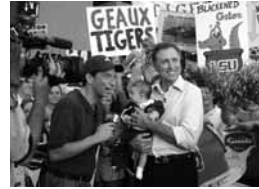
CBS's "The Early Show" aired live from Tiger Stadium on Oct. 5