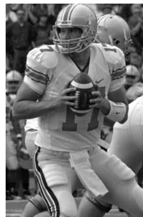
Quarterback Todd Boeckman