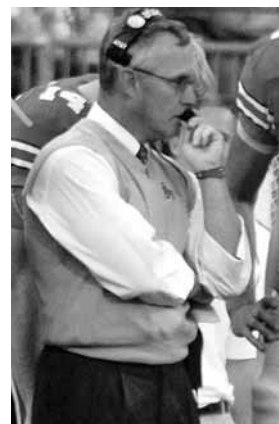
Head Coach Jim Tressel